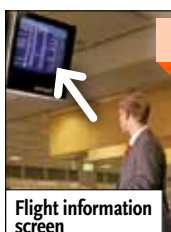
Flight information screen