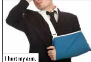
I hurt my arm.