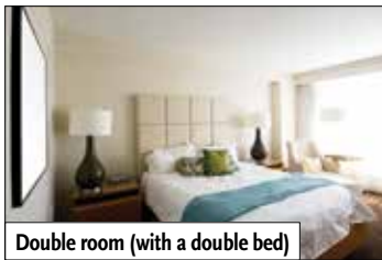
Double room (with a double bed)