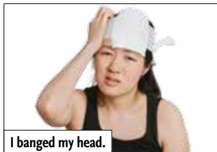
I banged my head.