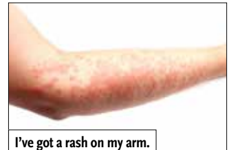
I've got a rash on my arm.