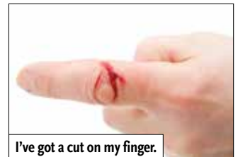
I've got a cut on my finger.