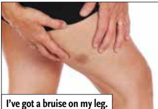
I've got a bruise on my leg.