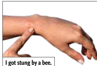
I got stung by a bee.