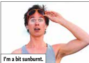
I'm a bit sunburnt.