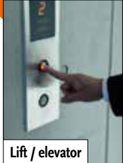
Lift / elevator