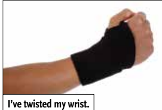
I've twisted my wrist.