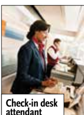
Check-in desk attendant