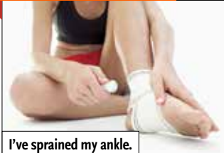
I've sprained my ankle.