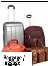
Baggage / luggage