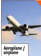
Aeroplane / airplane