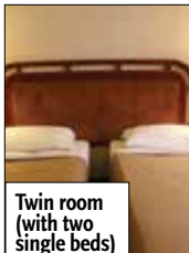
Twin room (with two single beds)