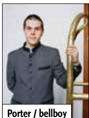
Porter / bellboy