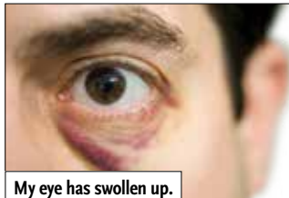
My eye has swollen up.