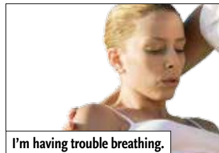
I'm having trouble breathing.