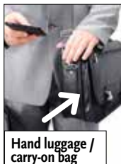
Hand luggage / carry-on bag