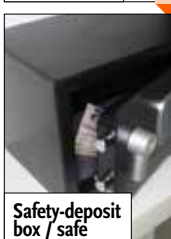
Safety-deposit box / safe